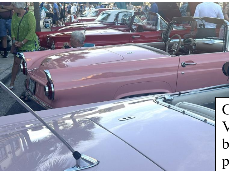
Our Club celebrated Valentine's Day with a beautiful showing of reds and pinks.