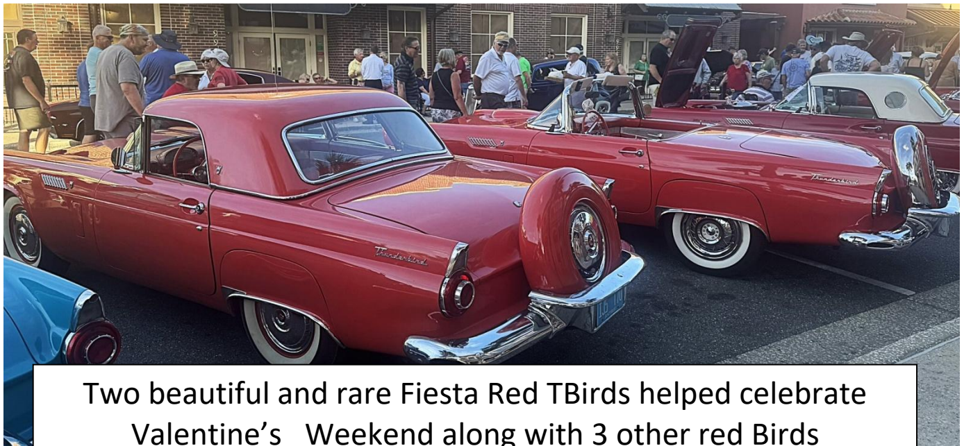
Two beautiful and rare Fiesta Red TBirds helped celebrate Valentine's Weekend along with 3 other red Birds