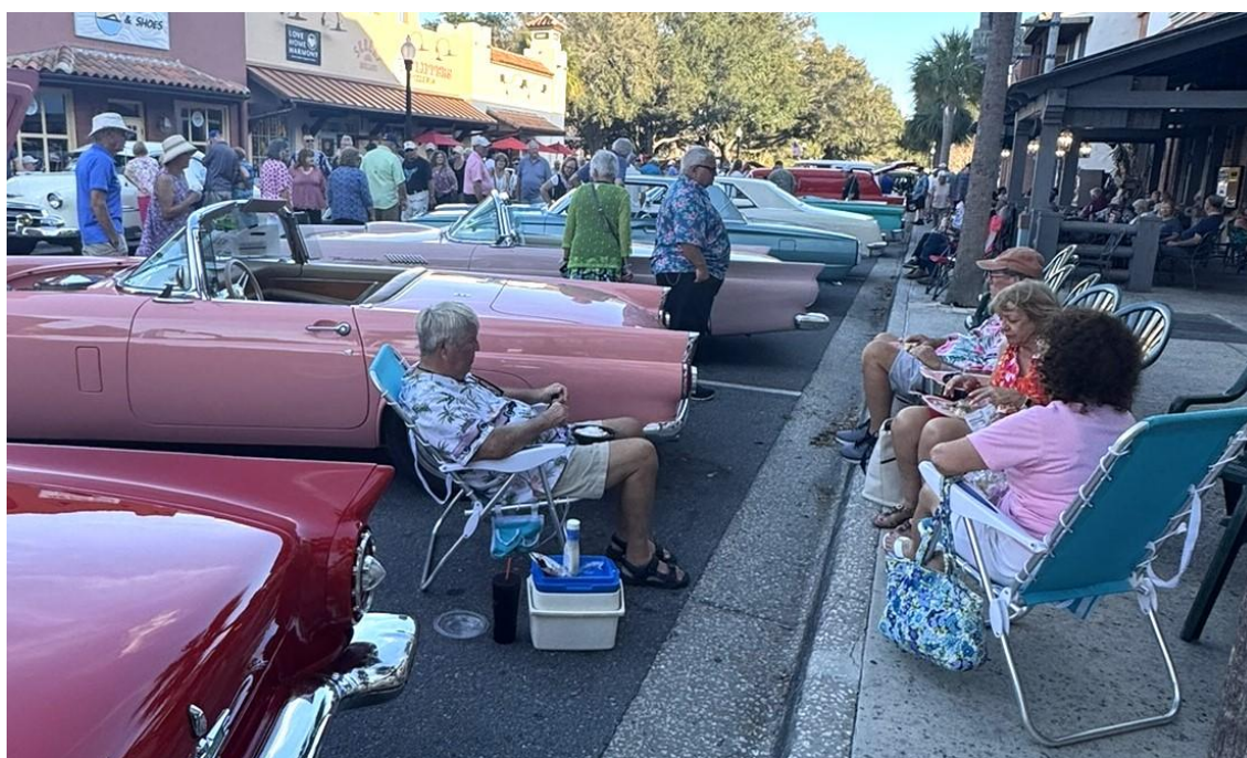
A beautiful evening with lots of car enthusiasts; Nine cars from our club participated in the cruise-in.